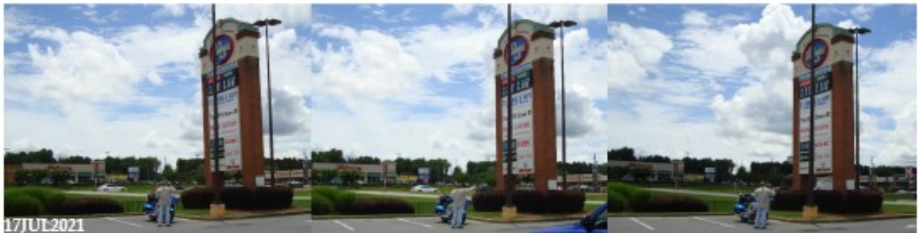
"Doing the Road Captain and Tail Gunner Safety Briefing"

I don't know if it was the cool temp., the no traffic, the no wait at the restaurant or what it was that made this a real nice ride, but I'm glad we didn't do this ride "virtually". Because they don't take reservations and it's so popular, we're going to have to be careful on scheduling this place again.